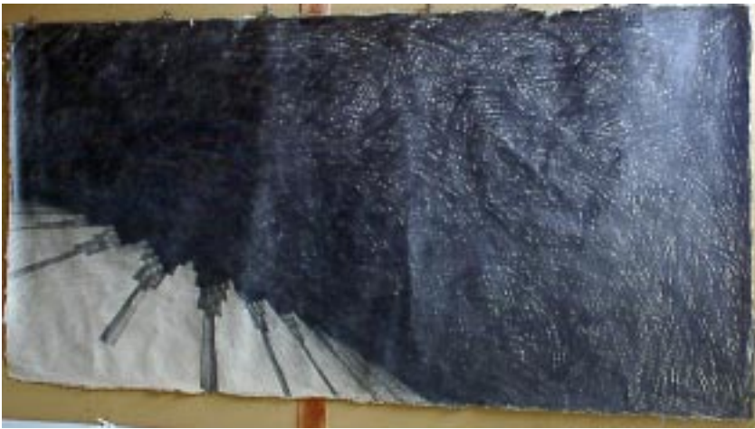
"Unknown Neighbourhood", 2000