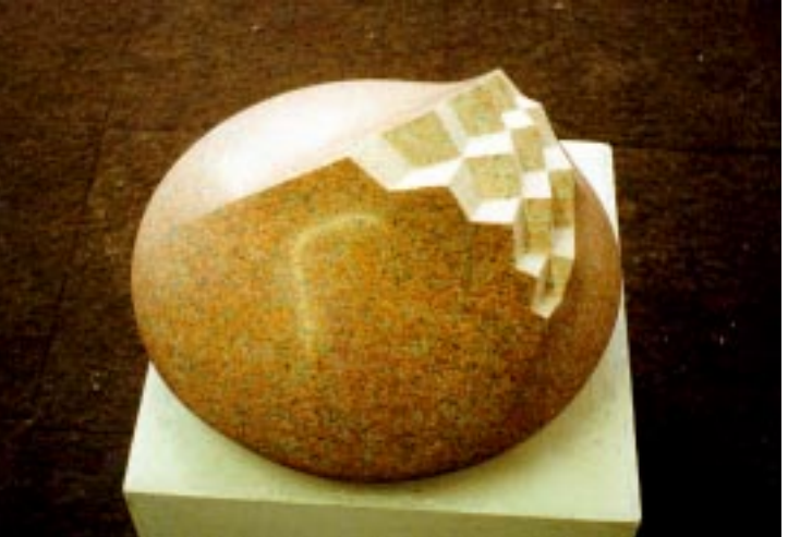
Day and Night, 1997 Sorrow Floats 1991