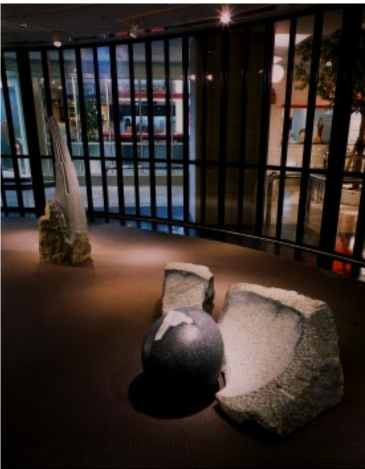
Your Time Will Come, 1989 A Causationist In Love, 1993